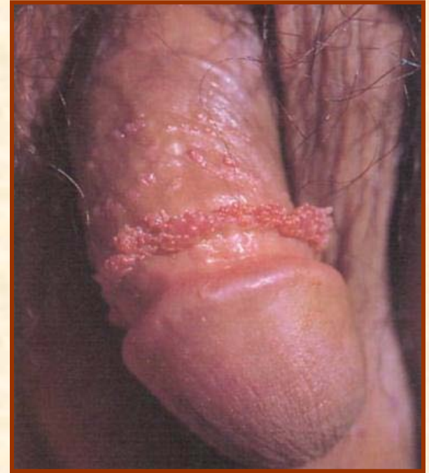
Condilomi da HPV